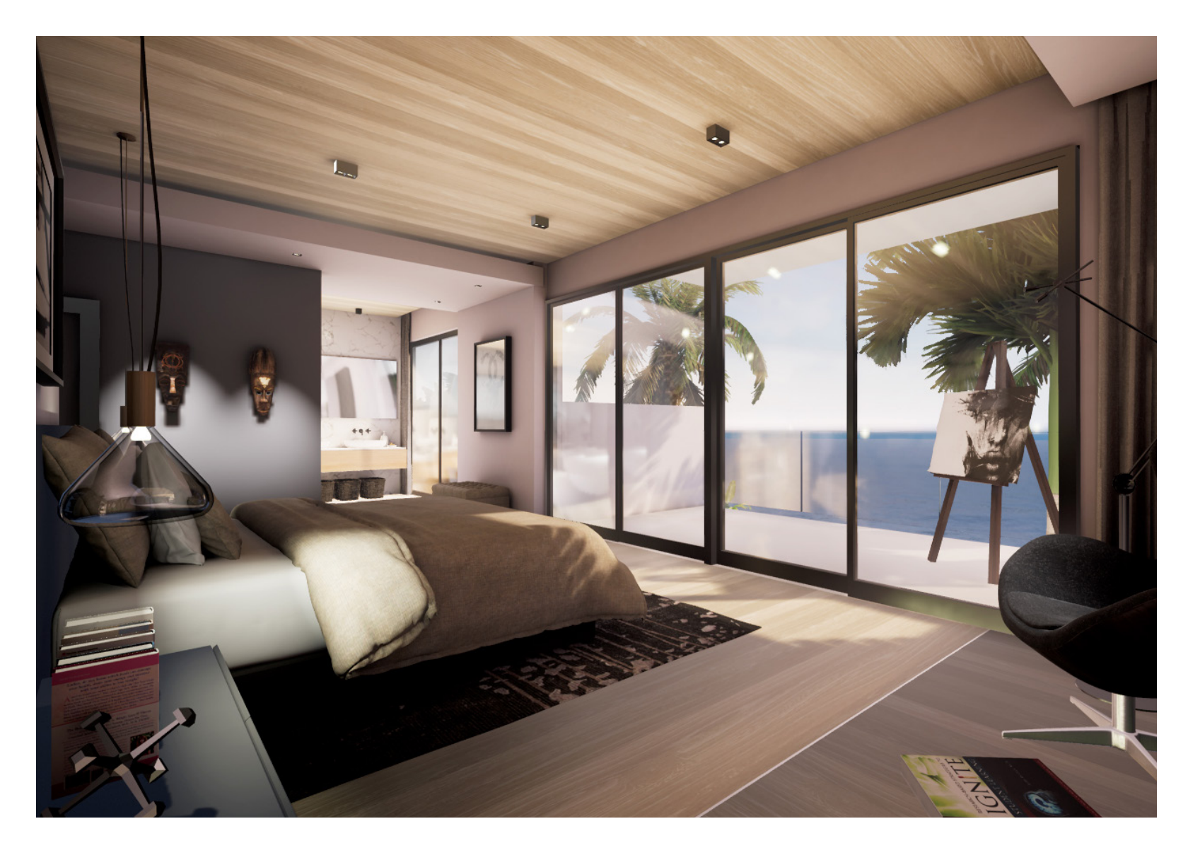
State of the art lighting illuminate every inch of area.