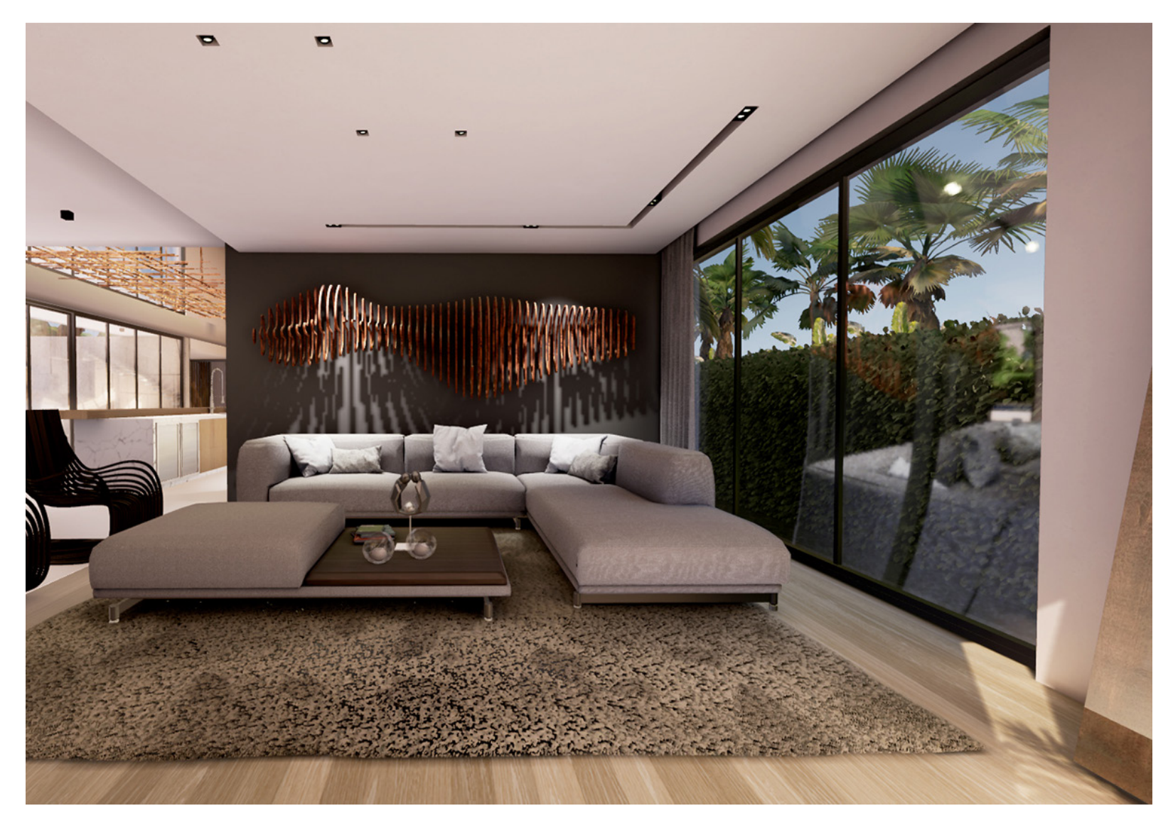
Spanning 5,121 square feet spread across two floors of openly designed space, Villa L'artiste includes 5 bedrooms, 5 full bathrooms and 1 powder room.