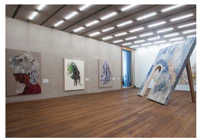
Perez Art Museum