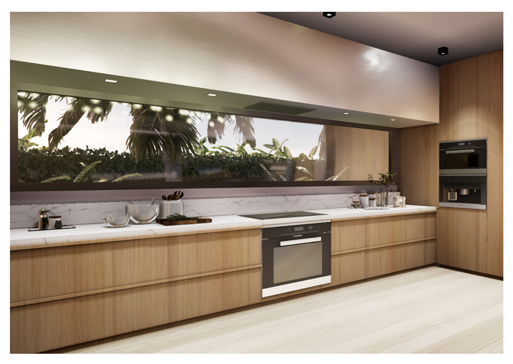
Step into the kitchen outfitted with a full suite of Miele appliances. The magnificent floating island is ornamented with INALCO ITOPKER marbled stone, and solid Oakwood countertop.