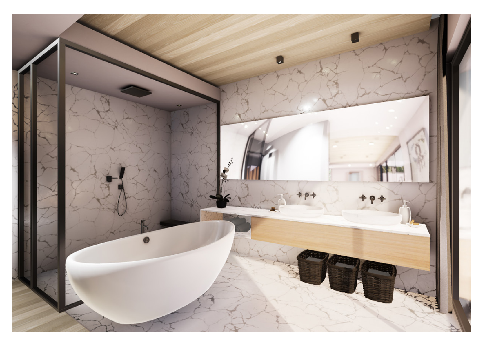
COTTO D'ESTE blazed limestone and GIGACER tiling adorn the kitchen, hallways, and bathrooms. Elegant STOCCO and Graff fixtures in each bathroom.