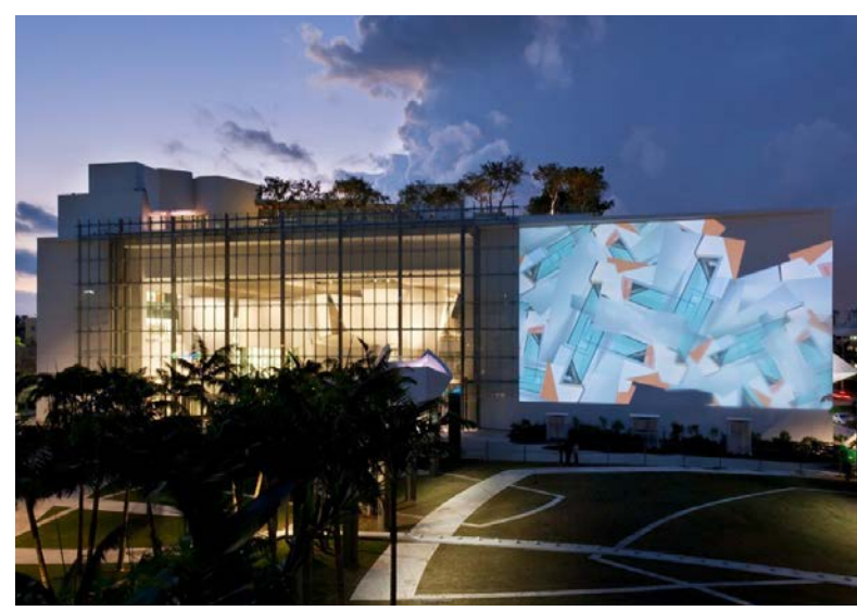
New World Symphony