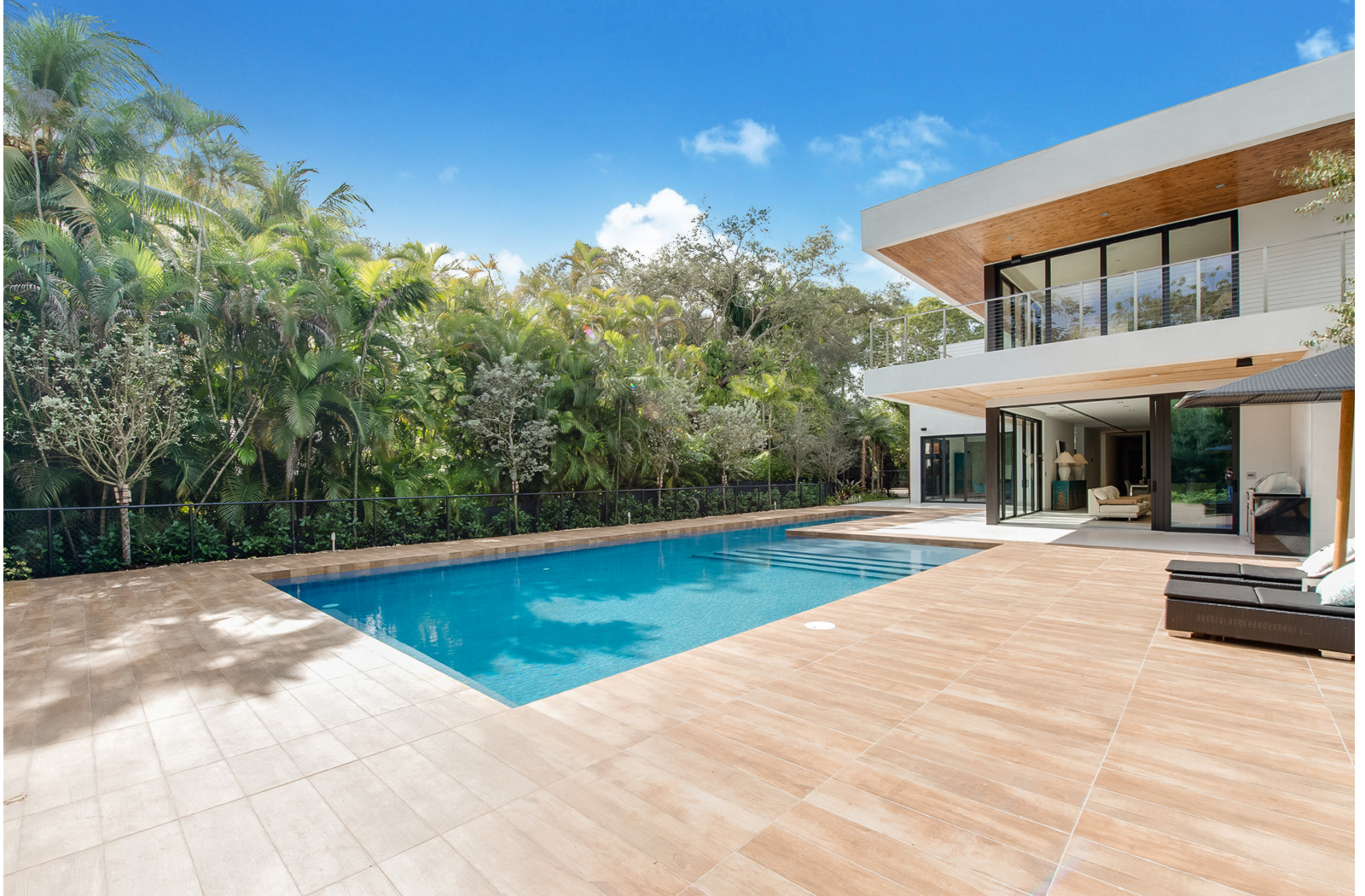
Composed of beautiful and resilient Brazilian IPE wood, the spacious deck hosts a lap swimming pool. There is a spa jacuzzi on the master suite's terrace.