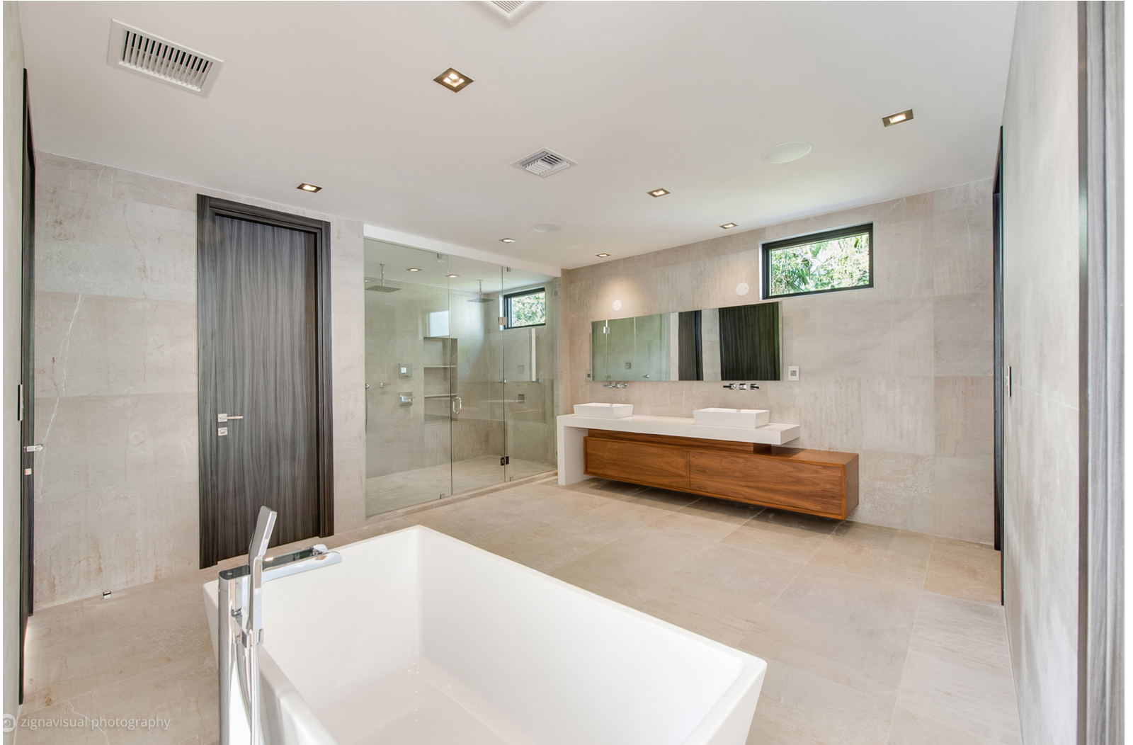
Bianco limestone tiling by COTTO d'ESTE decorate the kitchen, hallways, and bathrooms. Elegant CORIAN and DURAVIT fixtures in each bathroom.