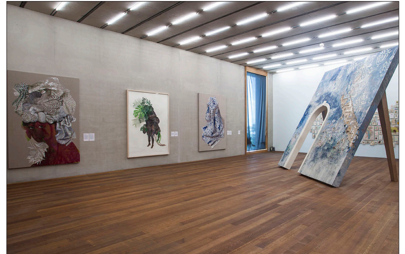
Perez Art Museum