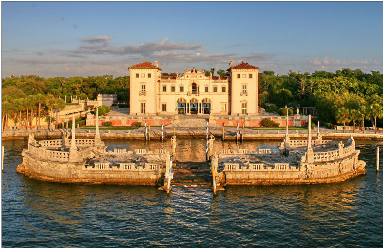
Vizcaya Museum and Gardens