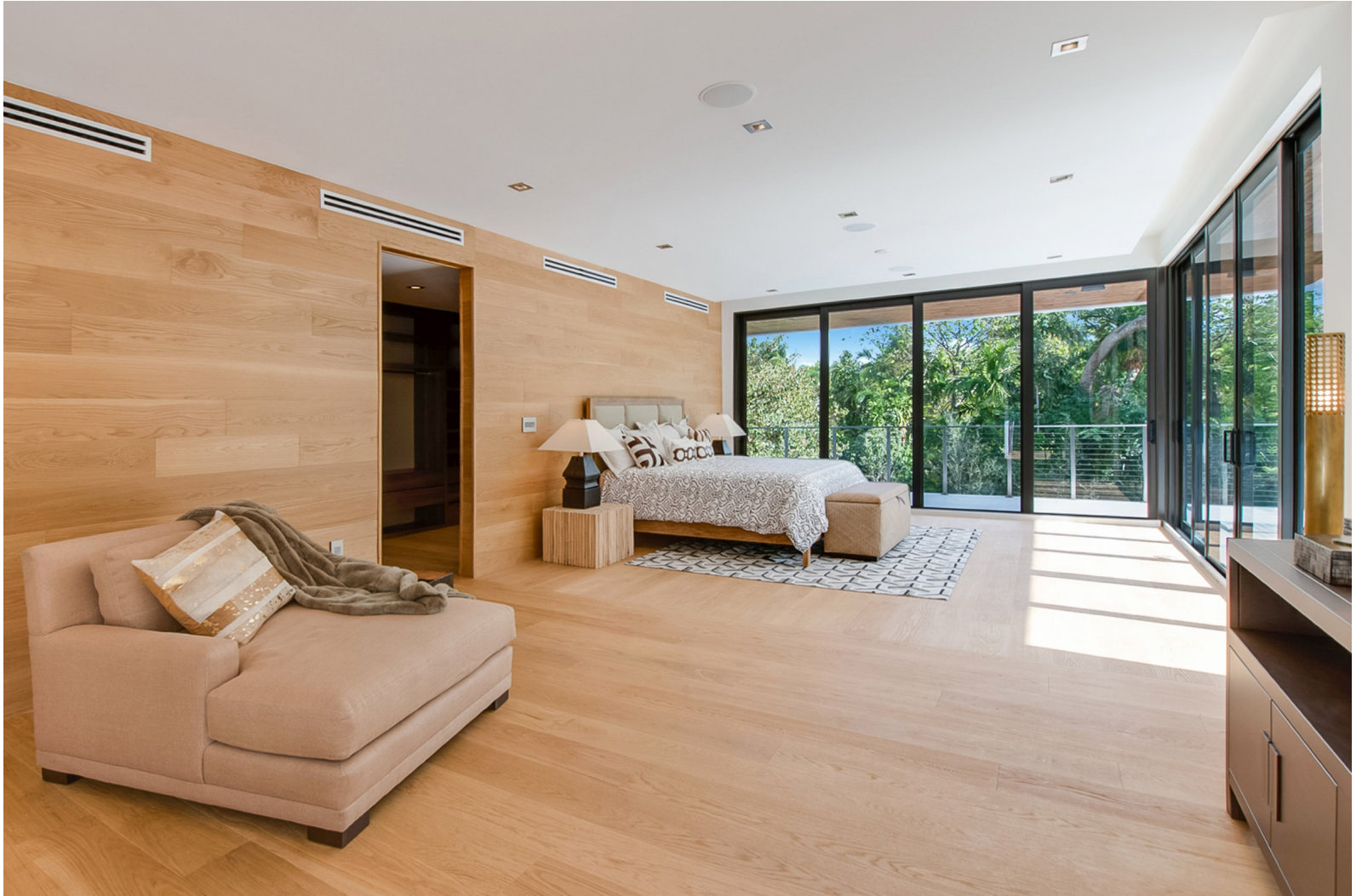
State of the art lighting illuminate every inch of the home.