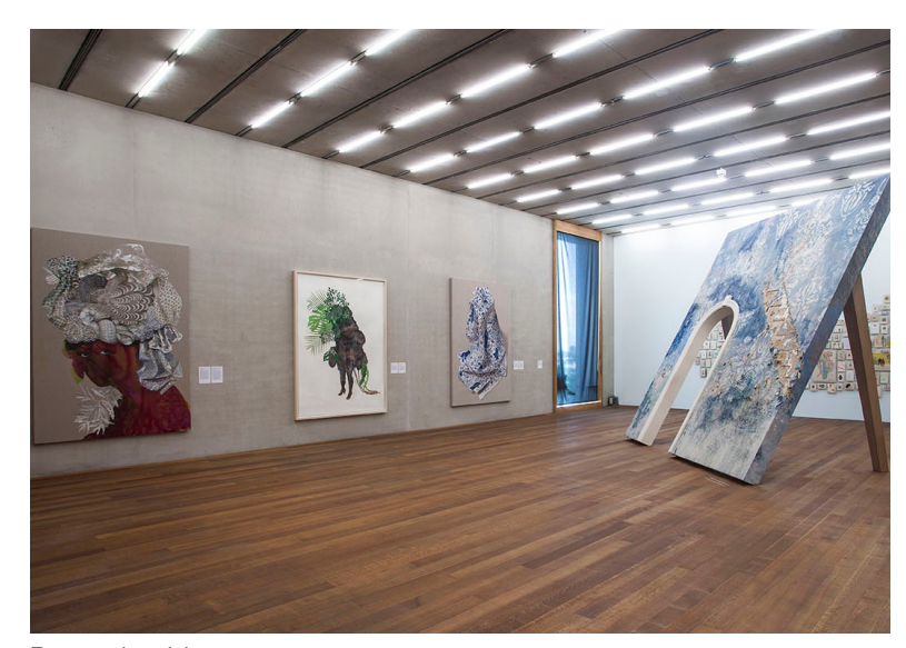
Perez Art Museum