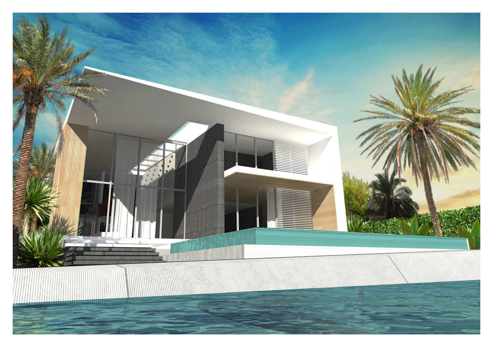
Spanning 5,043 square feet (469 sq. meters) spread across two floors of mostly open space, VILLA L'ATELIER includes 4 ample bedrooms, 3 full bathrooms and 3 powder rooms.