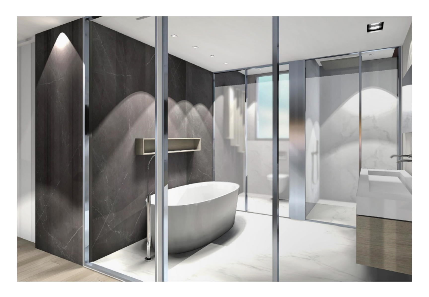
Cotto D'Este blazed limestone tiles adorn the floors in the kitchen, hallways, and bathrooms. Supple yet elegant Toto, Kolher and Terra fixtures in each bathroom.