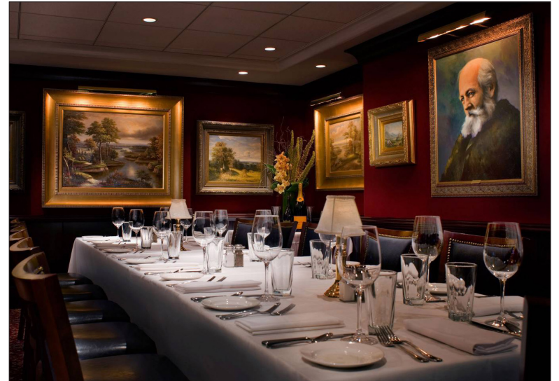
The Capital Grille