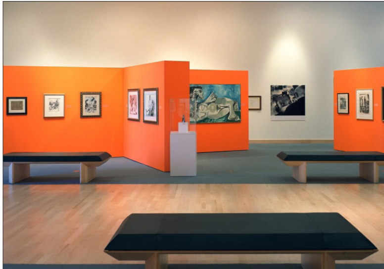
Boca Raton Museum of Art