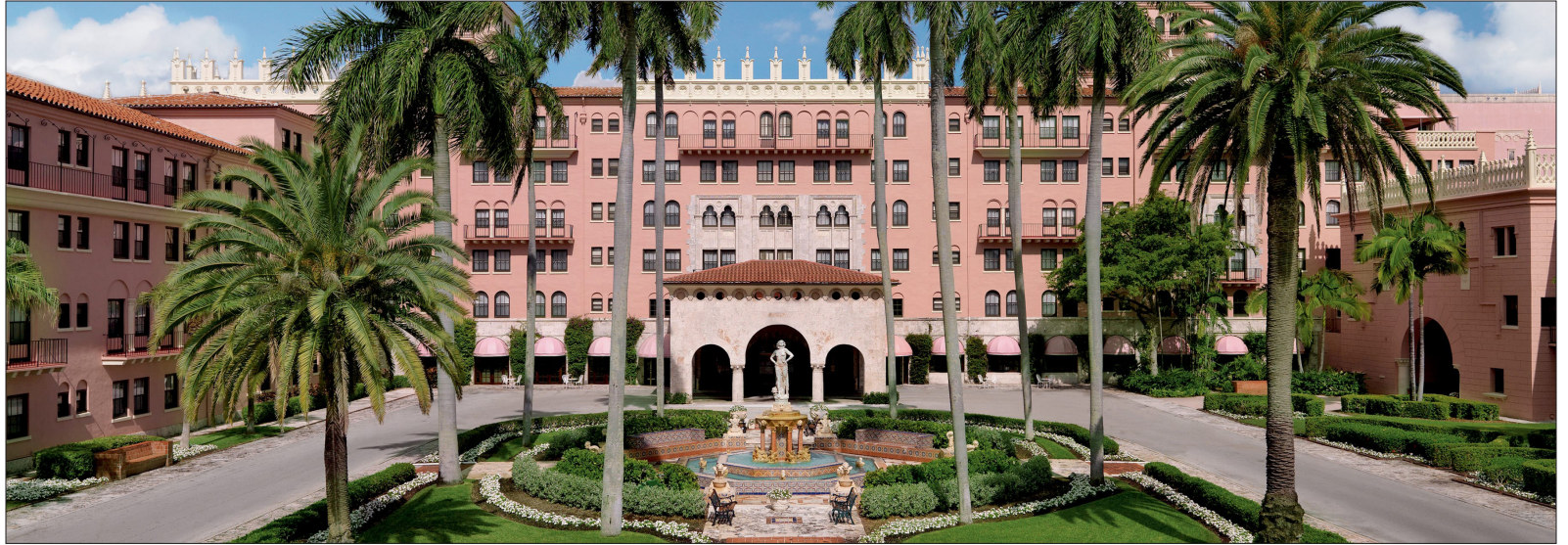
Boca Raton Resort & Club