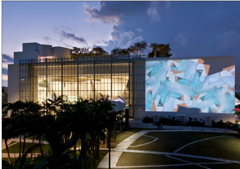
New World Symphony