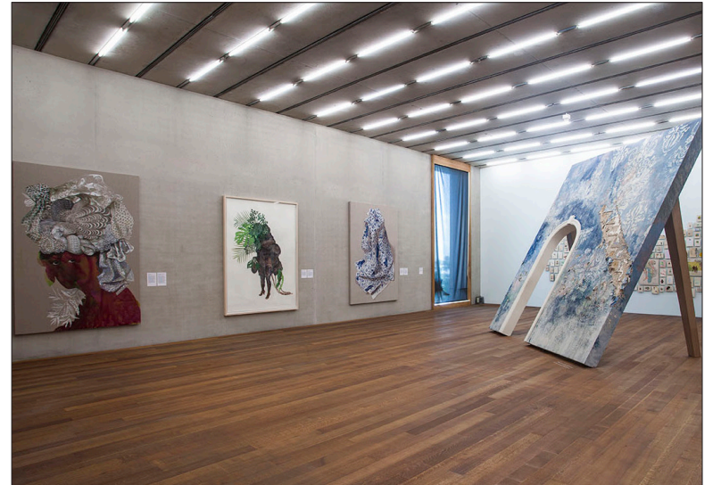
Perez Art Museum